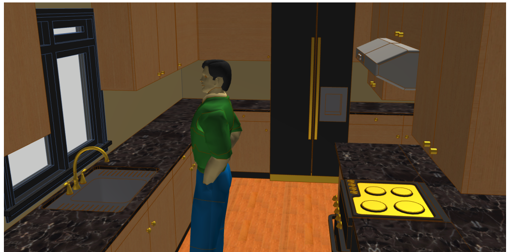
Custom 4'-0" by 3'-6"